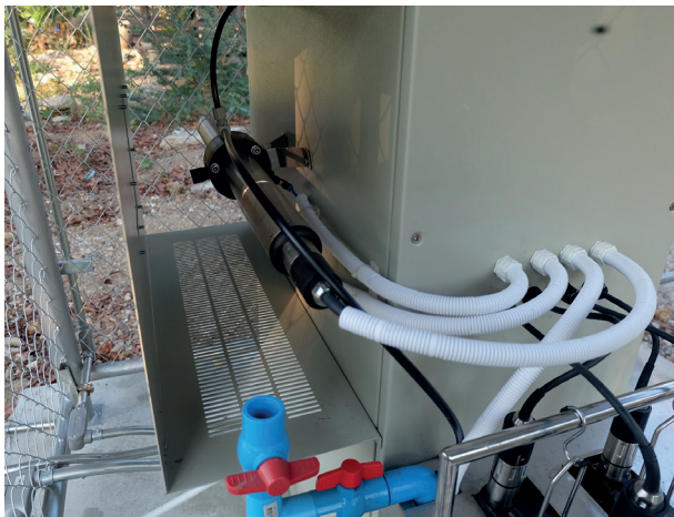
A spectral sensor with flow-through fitting, as well as additional compressed air cleaning, installed at the back of the measuring station.