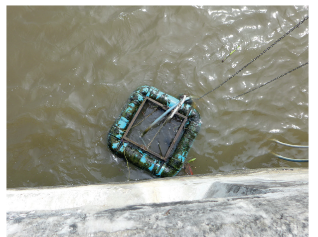
Water sampling site of a measuring station. The water is sampled by means of a submersion pump which is protected from debris and quick occlusion by a rough underwater metal cage. The sampling site is equipped with a floaters to allow water sampling during severely fluctuating water levels.