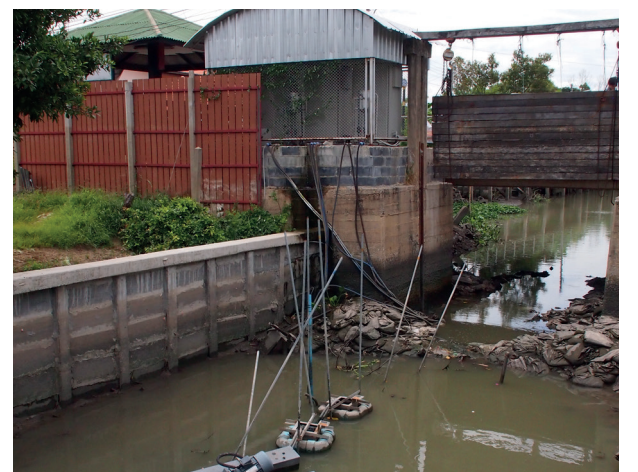
Khlong, where NiCaVis® 705 IQ tests for COD and nitrate were conducted by means of the spectral sensor. Discharged/inlet by a wastewater treatment plant in an industrial park in immediate vicinity.