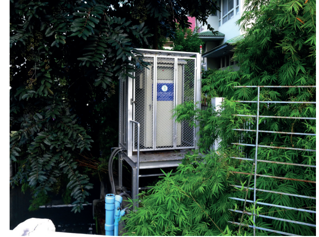
A measuring station at a Khlong in the city center.

+200 state-owned river water measuring stations for the measurement of water quality in the metropolitan area of Bangkok with measuring devices manufactured by WTW brand. The measured standard parameters are oxygen, turbidity, pH value and conductivity. Another 16 measuring stations were added which measure the additional chemical (COD) and the biochemical oxygen demand (BOD) as parameters for the organic load, as well as nitrate by means of spectral sensors (NiCaVis® 705 IQ).