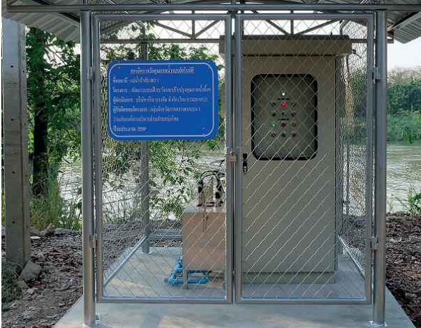
One of the 16 newly installed river water measuring stations in the metropolitan area of Bangkok. It is fitted with a housing to prevent vandalism and theft of measuring devices.