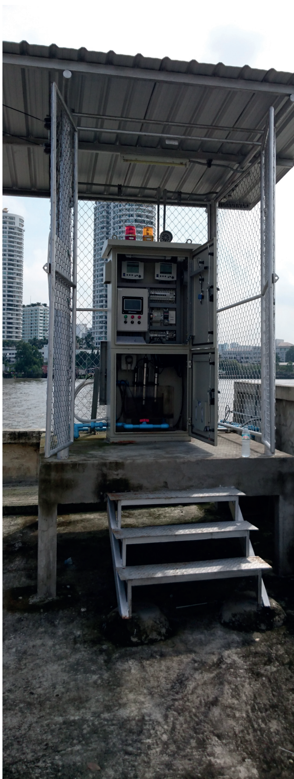
A measuring station at the river Chao Phraya in the city center of Bangkok.

As of now in 2023, the Thai business partner of Xylem Analytics Germany Sales, Green Banyan Co. Ltd., has equipped a total of