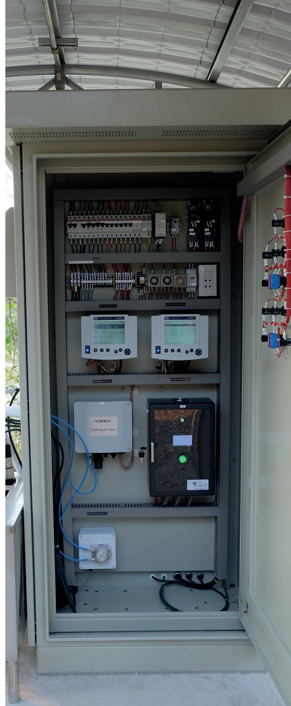
The inside of the measuring station with IQ controllers, a cleaning air box for the additional cleaning of the spectral sensor by means of compressed air as well as a modem for remote data transfer. To the left is the flow-through basin with installed oxygen, pH, conductivity and turbidity sensors.