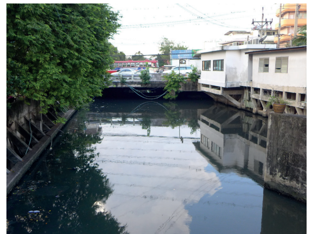
A Khlong in the city center of Bangkok.