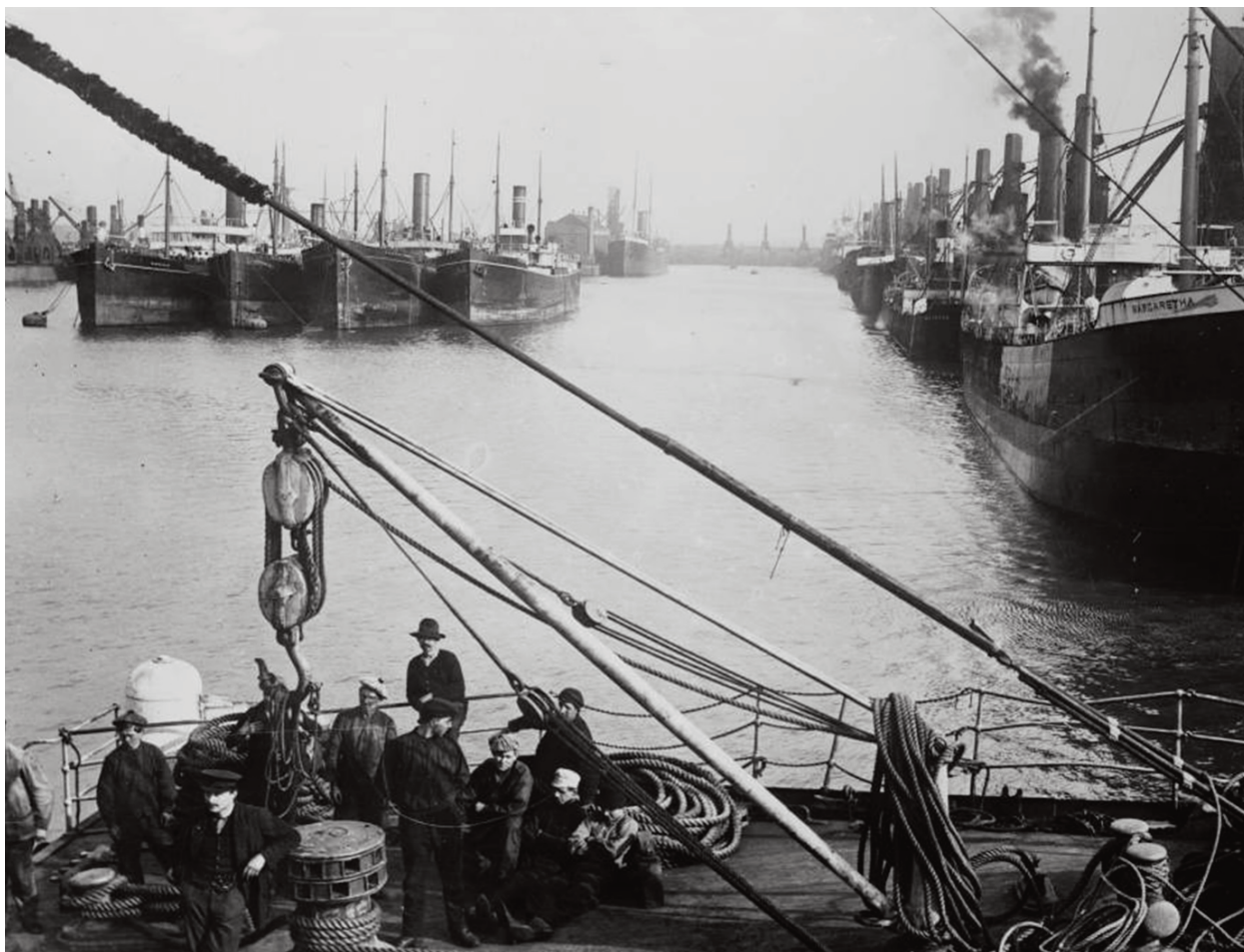
Cardiff used to handle more coal than any other port in the world

"One of the main concerns was the potential effect of the