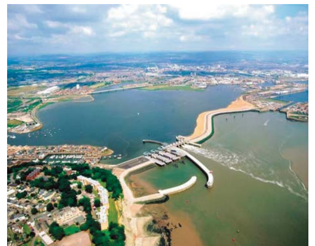
Construction of the Cardiff Bay barrage was completed in 2000

"The overwhelming success of this area hinges on the aesthetic quality of the bay; the water is clean, wildlife is thriving and many thousands of people enjoy a wide variety of leisure activities. Prosperity has once more returned to Cardiff, and this time, it's not coal we have to thank... its water."