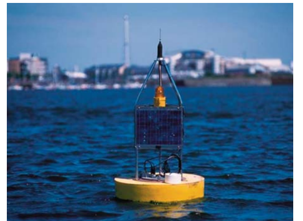
YSI Water Quality Monitoring Buoy