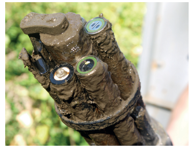
Effective anti-fouling using wiper

The best sensors with poor installation or maintenance will provide bad data. A robust maintenance program is required to ensure the best possible data. This is typically monthly or bi-monthly.