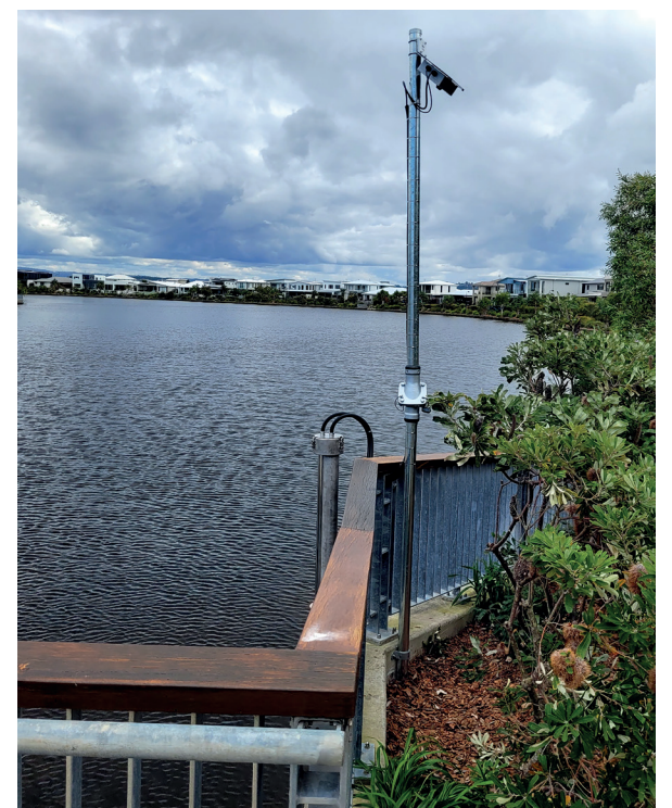
Solar Water Quality Monitoring Station

With an increase in the number of installed monitors, it is important to consider the installation design to remove the need for the user to enter the water during calibration or maintenance. Due to this requirement, it is recommended to use either multiparameter sondes installed in a standpipe or use of a pumped kiosk system.