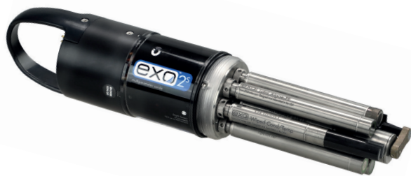
YSI EXO Multiparameter Sonde

With monitors being installed in both rural and urban environments, specific attention needs to be made to potential impacts of theft or vandalism. Site surveys are a must, to understand risks and design solutions for these sites.