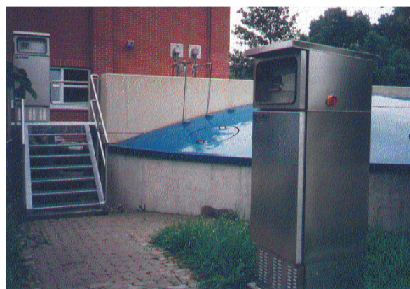
Figure 1: AMMONO-FIX online analyser at the WWTP Landshut

The "Terra-N-method" includes the conventional treatment of municipal waste water supplied to the WWTP: Preclarification, activation, final clarification. At first, however, the highly contaminated waste water from the sludge processing goes through the process stages described in Illustration 2, before being supplied to the denitrification stage of the WWTP. This procedure enables the degradation of more than 90% of the ammonium in the process