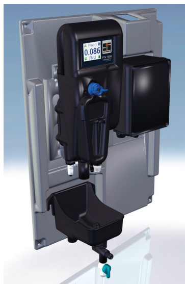
Pic 1 : Lovibond® PTV 1000/2000 Process-Turbidimeter

optimization. For the development of this instruments, a team of globally recognized turbidity experts has been assigned with the task to create a new process instruments that addresses all of the issues customers struggle with while using their current turbidity systems. These advancements, along with the addition of state-of-the-art communications and user interface make the PTV 1000/2000 series the next generation of process turbidimeters.