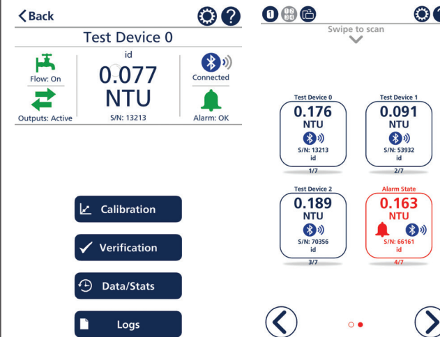
Pic. 5 : Screen views of AquaLXP™ - Interface

Since today's and, above all, the future generation of users is familiar with such end devices from day-to-day life, there is no need for an extensive enrollment of the controller functions and enables a more efficient focus on analytical and technical facts. This monitoring and control solution also allows the simultaneous control of several turbidity meters with only one terminal at the same location by means of secure Bluetooth technology.