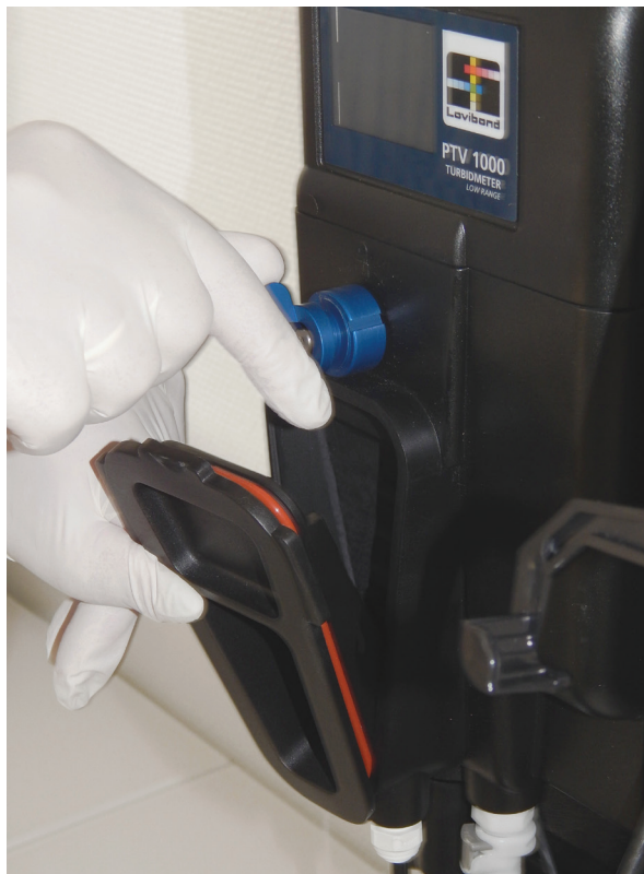
Pic. 3 : Air bubble trap with easy access from instrument front side

These bags contain stabilized formazine solutions with defined FNU/NTU values, filled at the factory under exclusion of air (no bubbles inside the bag) and with volumes precisely adjusted to the PTV 1000/2000. The bag material protects the solution inside from oxygen and UV radiation; both conditions which lead to