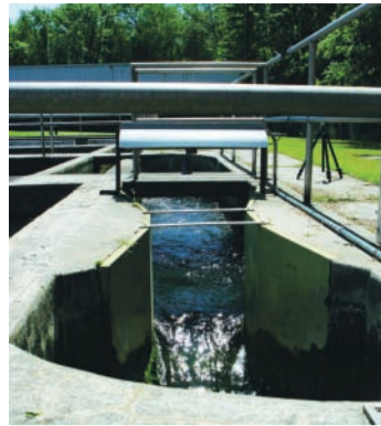
Several mounting options are available to install transducers over weirs and flumes. Accurate level readings of these open channels help avoid overflow conditions.

Care must be taken that the site at which the secondary measurement will take place is not affected by a change in the flow profile due to build-up. The flow quality at the location of the ultrasonic transducer should be as flat as possible. Surges or inputs close to the measuring point will affect accuracy. A clogged or impeded outflow will also degrade the quality of the measurement.