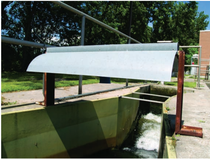
Fig 2. Sun shields ensure that radiant temperature fluctuations do not influence level readings.

A common omission in many open channel monitoring installations is the lack of a sun shield. Solar radiation can artificially heat up the transducer or temperature sensor and create false high ambient temperature conditions. A sun shield should be located over the transducer and remote temperature sensor to avoid these false readings. Adequate ventilation should be provided to avoid trapping heat under the shield. As discussed previously, temperature affects the speed of sound. An accurate representation of temperature is required for the best results in an open channel flow application.