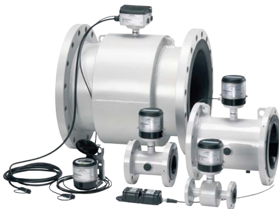
Figure 4: The battery-operated Sitrans MAG8000 electromagnetic water meter is also available with integral GSM/GPRS communication