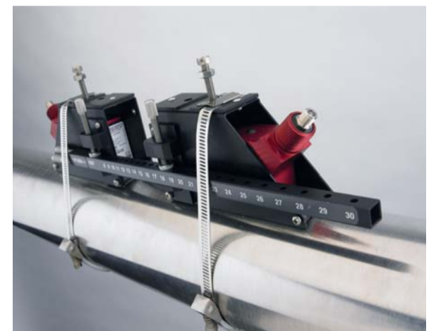
Figure 3: Ultrasonic transducer for clamp-on flow measurement.

The example shows that the installation of additional measuring