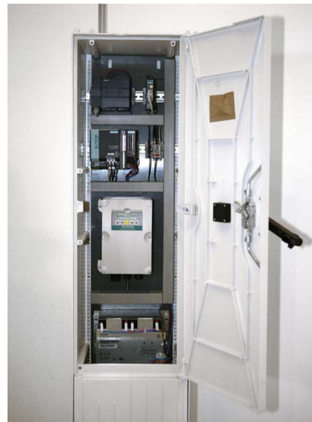
Figure 1: Siwa LeakControl system from Siemens including Sitrans FST020 transmitter for clamp-on flow measurement

A great advantage of the system is that it can be flexibly expanded according to requirements and available budget. Complete coverage of the network is not essential. For example, the first measuring points can be installed by the water suppliers at sensitive positions, i.e. in areas with an increased probability of damage. The Siwa LeakControl system is equally suitable for monitoring small networks with few measuring points or for monitoring hundreds of points in a megacity. Practically no limits exist for the system, since it can be used for almost all sizes and