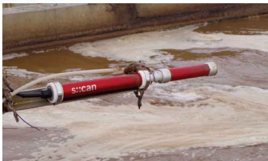
Figure 1: s::can spectro::lyser™ in industrial waste water treatment plant.

During the production of beer, not only the final product, but also other media ranging from pure drinking water to cleaning agents can be found in the reactors. After each cleaning cycle it must be ensured that all reagents have been removed completely before the next production batch can be started. The s::can spectrometer probe has been used to verify this point in the process: In collaboration with the laboratory of a brewery it was possible to develop individual calibrations monitoring these important components in the effluent of the production process of beer. Not only the end of the cleaning cycle could be detected, but also two different states of the product (filtered and non-filtered beer)