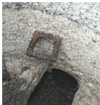
Figure 1: Example of sewer corrosion due to sulphuric acid formation from hydrogen sulphide.

The presence of sulphides in the wastewater has unpleasant consequences; First of all, sulphide can be biologically degraded, leading to the formation of sulphuric acid. This acid is known to be a main responsible for corrosion in sewer systems and pipes (figure 1). It attacks both concrete and metal, corrosion rates of several millimetres per year being no exception. Further adverse properties of hydrogen sulphide are its very strong and foul odour, even concentrations of 5 ppb can be perceived by humans. Besides this, it is also a highly toxic gas, with first ill effects induced at 10 - 20 ppm levels, and risk of fatalities at 300 - 500 ppm. This has led to numerous incidents involving sewer maintenance workers already.