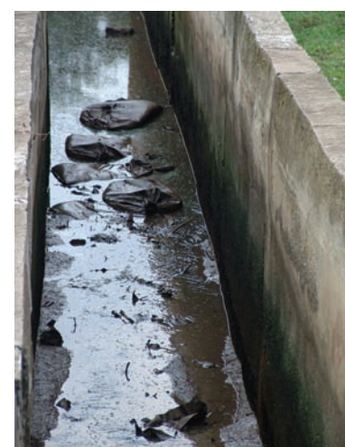
Figure 2: Open sewage pipe in Tra Noc Industrial Zone (IEEM, AKIZ-Project, sponsored by Federal Ministry of Education and Research)