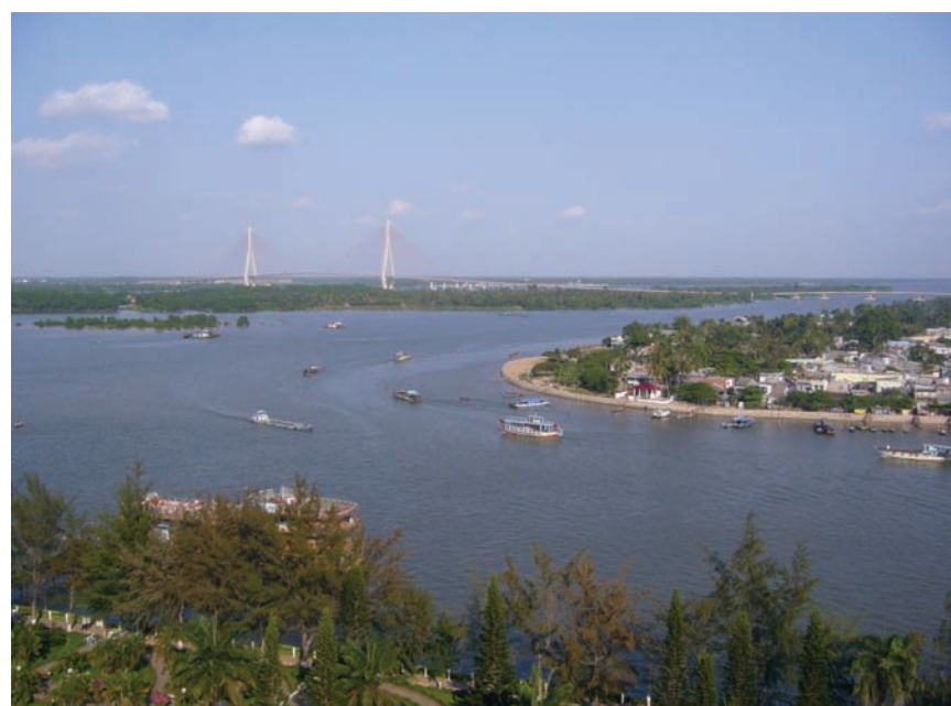
Figure 1: Mekong-Delta at Can Tho (IEEM, AKIZ-Project, sponsored by "Federal Ministry of Education and Research")

substances but the effect of such. There are a few test methods on the market that test whether the water sample triggers toxic effects on certain organisms such as fish, daphnia, algae or luminescence bacteria. However, many of these organisms are hard to obtain or to cultivate. Daphnia for example can only be cultivated under laboratory conditions and their suitability for toxicity tests is limited to a certain stage of development. Furthermore, many of these above-mentioned organisms are not sensitive enough or only sensitive against a certain group of toxins. In the case toxicity occurs, often the complete measuring system will be affected and the test organisms need to be replaced completely. Hence, the measuring methods are not well suited for online measurements in general as well as for the use as de-centralised monitoring in particular.