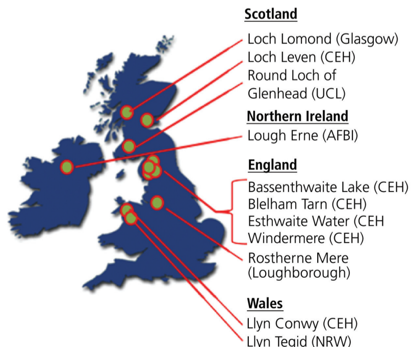
The location of the eleven UKLEON monitoring stations. Organisations responsible for each station are shown in parentheses.