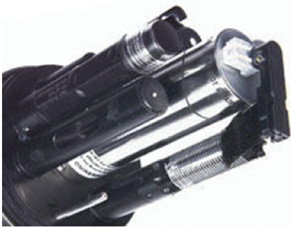
Hydrolab multiparameter water quality instrument courtesy of OTT Hydrometry Ltd. The rotating cleaning brush is visible to the right

Example of real-time data made available on the internet ( http://data.ecn.ac.uk/ukleon/results.asp ).