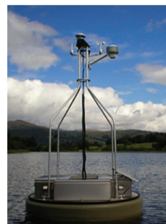
An automatic water quality monitoring station on Blelham Tarn.

Finally, there is an underwater light sensor to measure the light in water in comparison to a similar sensor just above the water surface. Bio-fouling of the sensors, especially in productive sites, has been largely overcome with automatic wipers to remove biofilm. Each AWQMS is powered by lead-acid batteries with most of the power in the summer provided by two solar panels.