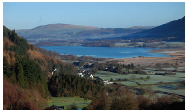
Bassenthwaite Lake, Cumbria.

UKLEON is funded as part of the Natural Environment Research Council's Sensor Network Programme. It is led from the NERC Centre for Ecology & Hydrology (CEH) in collaboration with the Universities of Glasgow, Lancaster, Loughborough and University College London and also with Natural Resources Wales. A substantial additional input of time and expertise has been contributed by staff from the UK Astronomy Technology Centre (UKATC) with expertise in handling large volumes of data. Two UK companies are also heavily involved in providing off-the shelf and bespoke equipment for the project: OTT Hydrometry Ltd and Lakeland Instrumentation Ltd. OTT Hydrometry are contributing further by funding a PhD as part of the project.