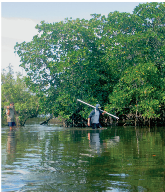
SIF staff transporting the equipment through the rough terrain

allows the separation of changes in water level related to the incoming tides from changes caused by rainfall.