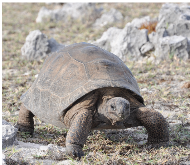
Aldabra atoll is a unique habitat, home to many endemic species and is inscribed on the UNESCO world heritage list.

One benchmark habitat is Aldabra atoll, which is part of the island state Seychelles located in the Indian Ocean off the coast of Africa. This world-heritage natural reserve is 35 km in length and has no permanent residents. Aldabra was added to the programme as a sample of a pristine ecosystem, largely untouched by human activity. Also, it is highly exposed to rising sea levels with most areas not exceeding eight meters above sea level. The reefs, which form its foundations, boast marine life in all forms. The world's greatest population of giant tortoises shares the slender ring of land with huge colonies of sea birds. Large parts of the islands are covered in scrub and grasslands. The coastal area is dominated by rocky shores with a few wonderful white beaches while the sheltered interior is partly covered by mangroves.