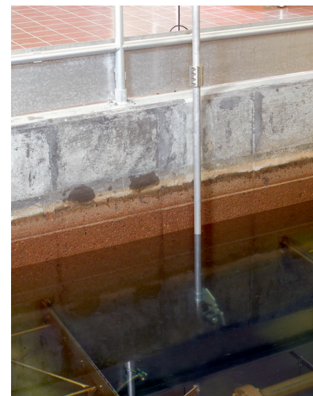
SOLITAX sc turbidimeter mounted above the filter bed

optimal savings and for ease of access. Mounting the probe in a pipe downstream of the filter or in a manifold to monitor a number of filters with the same sensor may well create too much delay in measurement. This delay will eliminate any possible benefit that could otherwise be gained. In-pipe or manifold mounting should be used only as a last resort.