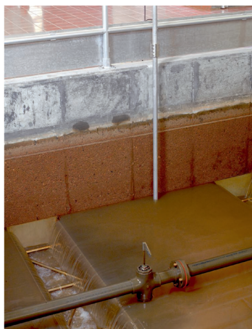
Water used for washing running into the backwash troughs

Rapid filters, rapid sand, dual media and multimedia beds require periodic cleaning to remove accumulated solids.