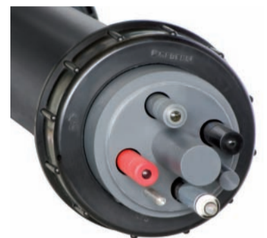
The ISEmax sensor consists of ion-selective electrodes and a reference electrode which are installed in an immersion assembly with automatic compressed-air cleaning and a pre-amplifier

In this measuring principle, the color and turbidity of the measuring solution does not affect the measurement result. Since the ISE is immersed directly into the measuring solution and exhibits rapid response behavior, the measuring system responds very quickly to changes in the concentration. The measuring signal and concentration of the measuring ions are directly related over a very broad range in such a way that these systems can cover a very wide measuring range.