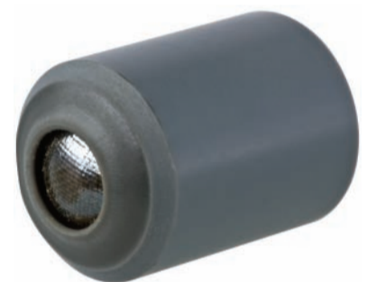
Membrane caps that are quick and easy to replace are available as an accessory kit.