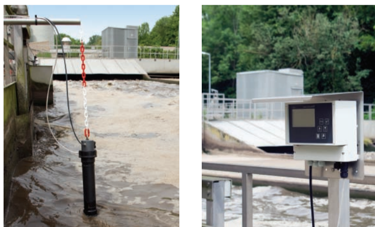
ISEmax used in the activated sludge basin of a municipal waste water treatment plant.

Up to three ion-selective electrodes simultaneously measure ammonium, nitrate and other measured variables, like potassium,