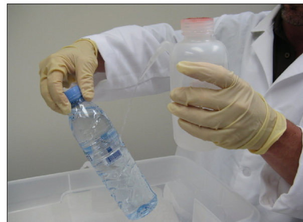
Figure 2: Washing of the sample bottles for contamination elimination

After logging, the samples were individually cleaned, bagged, and stored in an argon-purged enclosure. The bottles were cleaned by rinsing the outside of the bottle with 3% HCl followed by purged DI water (see Figure 2). Bottles were dried, labeled and logged, and stored in zipper storage bags until analysis.