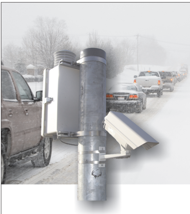
Campbell Scientific's Infra-Red Road Weather Station with integral power and communications provides a cost effective way to monitor more sites

The system consists of an IR100 remote temperature sensor with a special housing and an environmental enclosure containing a Campbell Scientific CR850 data logger, a GPRS data modem, an air temperature and relative humidity probe and a power pack charged by an integral solar panel.