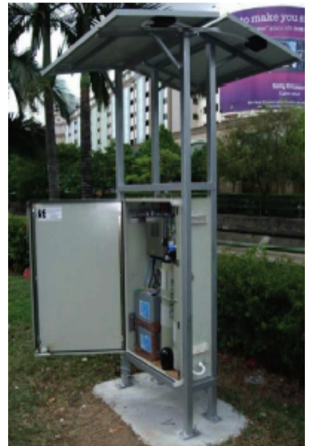
Figure 5: Example of a stand-alone solar powered monitoring station with wireless data transmission to a web-based data collection system as deployed in Singapore.

A great number of technologies and systems are available for water quality monitoring. Increasingly, instruments can be deployed in-situ and can measure continuously and in real-time. Although most systems have reached a stage of maturity allowing deployment in the field, some have limited applicability due to their complex nature and the need for an advanced infrastructure. The less complex systems, however, allow autonomous operation for extended periods. Solar powered instruments with automatic cleaning systems and wireless communications interfaces for remote access and real-time data collection are becoming commonplace and enable deployment at remote, unmanned stations and in buoys. As more and more data is collected, handling and interpreting this information for management procedures is becoming the next challenge in water quality monitoring.