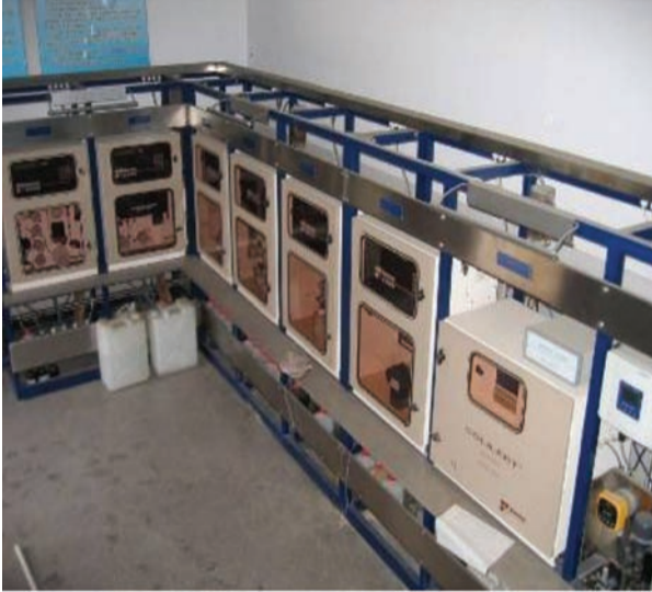
Figure 2: Cabinet analysers at a monitoring station in China.

interest and the analyser measures the reaction products or the disappearance of the reagent, often electrochemically or using a photometer. Apart from phosphate, analysers offer the ability to detect contaminants, such as metals and arsenic, which cannot easily be measured in-line with other technologies. The disadvantage of analysers is the maintenance required, which includes the replenishment of reagents, tubing and pumps on a regular basis. This requires skilled personnel and easy site access, confining the applicability of analysers to centrally located monitoring stations with well-trained staff.