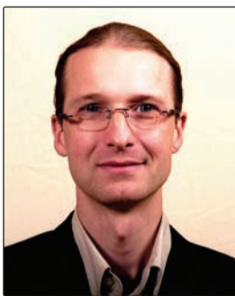
Author Details: Joep van den Broeke Benten Water Solutions

Effective management of the water sources requires information and understanding. Water quality monitoring networks are in place across the entire region; for example, both India and China maintain networks with thousands of monitoring sites. Despite the impressive numbers, however, spatial coverage remains sparse due to the size of the continent. Furthermore, monitoring consists primarily of infrequent manual analysis of a few physical-chemical parameters suited neither to map out the dynamics of water quality variability nor to properly assess chemical and biological quality. This is becoming increasingly apparent, and both China and India are investing in setting up networks of stations for continuous water quality monitoring. For example, in its 11 th Five Year Plan, the Chinese government intends to establish an advanced environmental monitoring system, equipping all key sources of pollution with automatic monitoring instruments. More recently, the World Bank has awarded the River Ganges Improvement Contract to set up a network of online monitoring stations along India's River Ganges, and the Taiwanese EPA initiated the installation of real-time monitoring systems at 114 large-scale enterprises around the country to monitor violations of its Water Pollution Control Act.