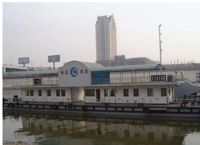
Figure 1: Floating monitoring station, Yangtze River, China.