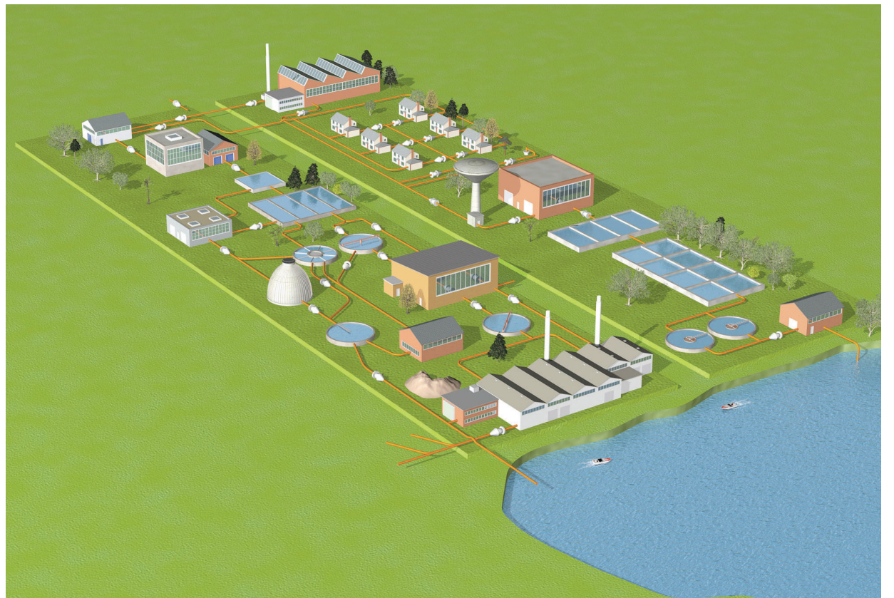
ABB supplies a host of instrumentation equipment for use around the water and waste water treatment cycle

The situation for sites that do not fall under PPC remains unclear. On the one hand, sites under the Water Resources Act have been largely monitored by Agency staff and there is likely to