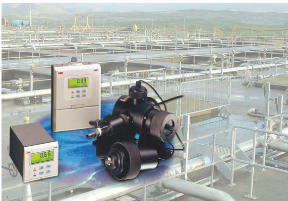
ABB's turbidity monitoring equipment is suitable for use in raw water and effluent discharge applications

The water industry faces uncertainty in a changing legislative climate. Only the right monitoring systems can ensure that its operations comply with any future requirements, writes Jim Plumley, ABB Instrumentation.