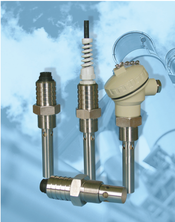
ABB's AC200 conductivity cell with in-built temperature sensor is ideal for water treatment applications.

remain the same for the forthcoming water scheme: