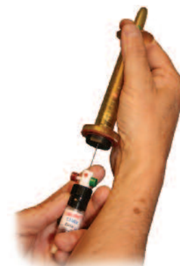
CALION™ Performance Validation Standard

These contain standard compounds that are carried in solidified liquid particles, where the compounds maintain equilibrium between the solid particles and the vial's headspace. CUSTODION™ SPME sampling of the headspace results in the collection of analytes on the SPME fibre from the vapour phase. The collected standards are then injected into the TRIDION-9 GC-TMS for analysis.