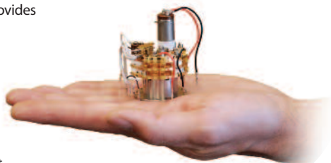
Miniaturised Toroidal Ion Trap Mass Spectrometer (TMS)

The TRIDION-9 mass analyser runs at 175°C and operates under vacuum so that the electrodes stay cleaner longer. This reduces the need for frequent maintenance, while increasing mass spectral quality and reproducibility. Performing at