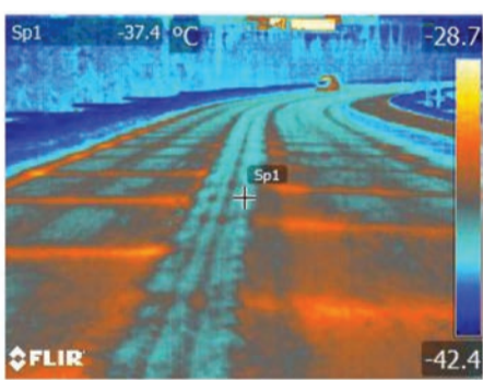
Thermal imaging can be used to see whether cooling devices of road infrastructures are working effectively.

Infrastructure works in permafrost areas have their own issues. For example, the process of clearing vegetation and constructing roadway embankments is one that often produces local warming of the ground surface. The warming, in turn, interferes with the thermal state of the underlying permafrost, which causes thawing. If the permafrost has a high amount of ice content, then the thawing will result in settlement (usually referred to as thaw settlement) and damage to above-ground structures. For example for highway construction, thawing permafrost will cause roadways to become distorted or damaged.