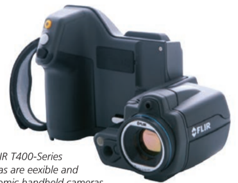
The FLIR T400-Series cameras are flexible and ergonomic handheld cameras.

One example is the Baikal-Amur Mainline (BAM), a 4,324 km long railway traversing Eastern Siberia and the Russian Far East. Since 2000 already, BAM experts of the railway's permafrost station have been using aerial thermography to determine the performance of cooling piles and artificial structures along this railway line.