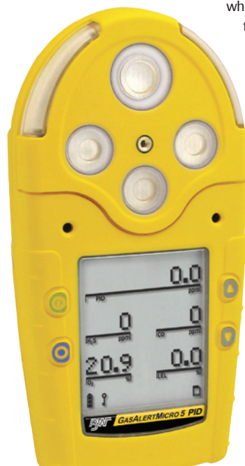
Figure 1: Compact multi-sensor instruments that include O 2 , LEL electrochemical toxic and miniaturized PID sensors are available in diffusion as well as motorized pump-equipped versions

The exposure limit in isobutylene units (EL iso ) is calculated by dividing the exposure limit (OEL) for the VOC by the correction factor (CF iso ) for the substance. The UK OEL for turpentine is 100 ppm. Thus, if the CF for turpentine