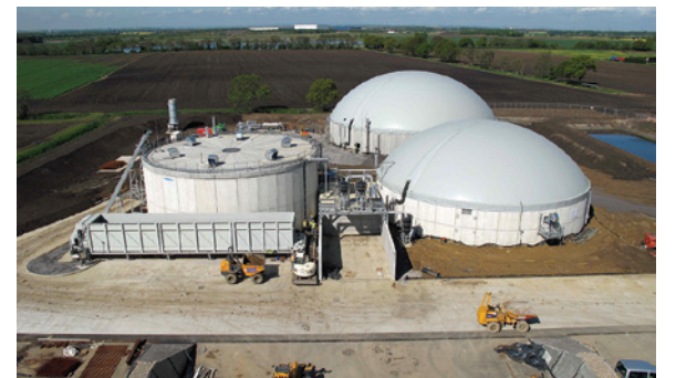
The Doncaster site where upgrading takes place

To find out more about Geotech's fixed and portable gas analysers please contact us (details on page 8). We will also be exhibiting at ADBA's National Conference in London on 9th December.