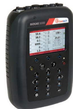
Geotech's portable biogas analyser is used globally.