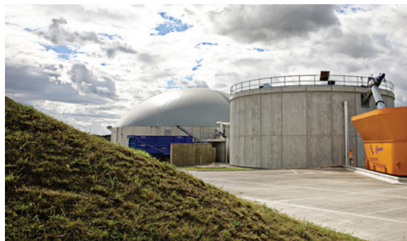
Digester at the Norwich site

The AD process also produces a natural, odourless fertiliser called digestate, this organic fertiliser contains all of the