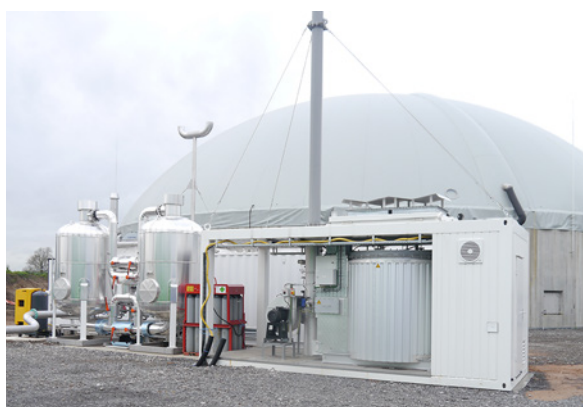
Air Liquide's upgrading vessel at the Doncaster site

Future Biogas's £8m Vulcan Renewables AD plant produces up to