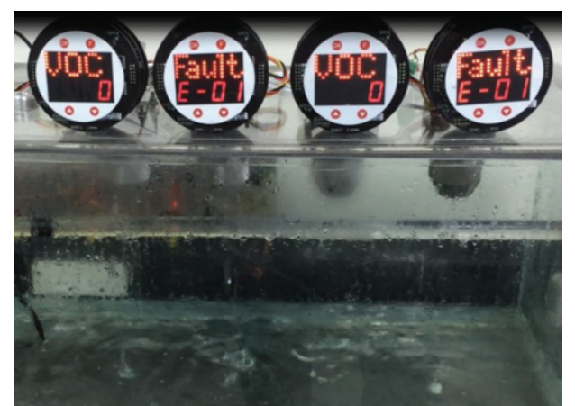
Figure 2 – Falco used in condensing environments