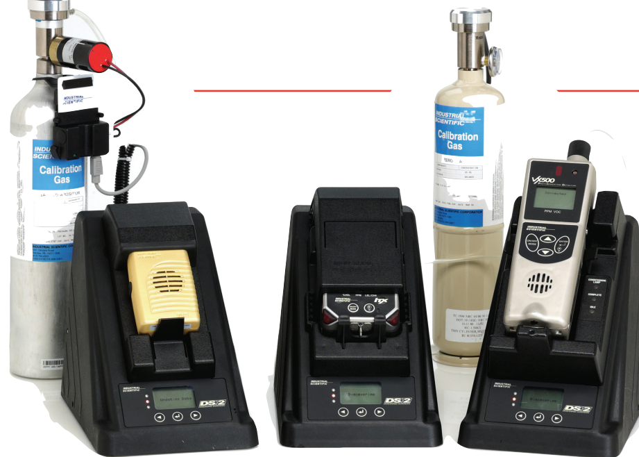
Figure 3: Systems such as the Docking Station provide automated instrument management and recordkeeping.

Advances in instrument maintenance and management have been made over the past couple of years. These improvements significantly help today's hygienist and safety officers maintain records and calibrate/test the instruments. Instrument docking systems are available that allow users to charge the instrument, download the hygiene data, schedule routine calibrations and bump tests, and run diagnostic tests. More advanced systems allow users in multiple locations to share data over networks. This allows companies with multiple locations in a city, or around to world to manage and store all of their instrument data in one centralized location. Being able schedule bump testing and calibration reduces maintenance time and cost for the end user. These functions can be programmed to happen automatically on a specific day and time. This will allow the user to "dock" their instrument