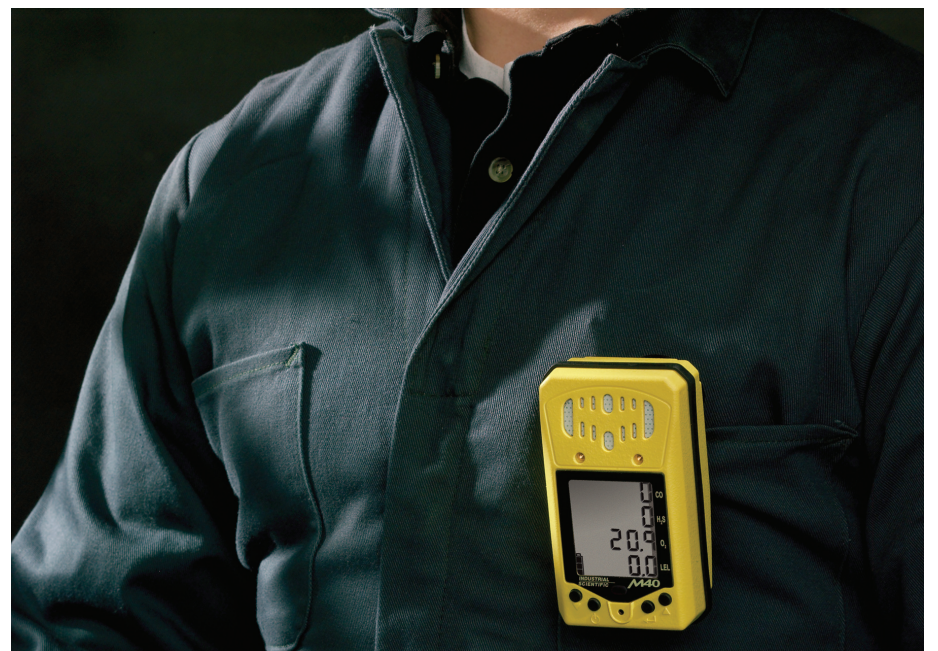
Figure 2: Compact sized, personal multi-gas monitors are ideal for a wide variety of hazardous and confined space applications.

Personal safety monitors should have a full feature set of alarms including low, high, TWA, STEL and low battery warnings to alert the user of any unsafe condition. When the instrument goes into alarm, loud audible, bright visual, and internal vibrating alarms alert the user that there is a hazardous condition.