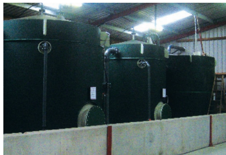
Figure 2: Digester Tanks

biomethane. The degree of final gas conditioning is dependant on the intended use of the gas, ranging from a simple water "knock out" drying process for burning the gas in glasshouse boilers, to a more sophisticated chemical scrubbing process to remove hydrogen sulphide levels to less than 1000 ppm v/v for use with the CHP engine generator. For biomethane production for use in vehicles, the hydrogen sulphide (H 2 S) level has to be reduced to <10ppm and the carbon dioxide gas (CO 2 )