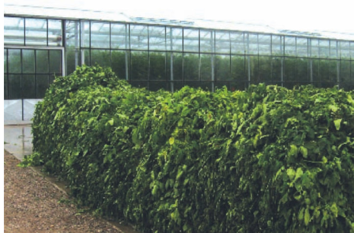
Figure 1: Waste Tomato Plants

Issues encountered during the project included the requirement to measure high concentrations of hydrogen sulphide gas (>2000 ppm H 2 S) in the final stages of the digestion process, which resulted from the breakdown of sulphate based fertiliser chemicals being present in the tomato plant digestate. To overcome this problem the hydrogen sulphide measuring range was increased to 5000 ppm H 2 S, which allowed the biogas to be monitored before and after the hydrogen sulphide scrubbing system. Typical levels of H 2 S gas after the scrubber were less than 10 ppm v/v, with suitable alarm levels being programmed on the gas analyser to pick up any breakthrough of H 2 S gas in the event