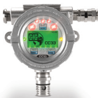
CC33 stainless steel

In a world in which economic success increasingly depends on data-driven process optimization and process automation, not being able to access all necessary information is no longer an option. But to rip and replace an existing and functioning infrastructure, just to achieve the necessary bandwidth for data transmission, makes neither economic nor ecological sense.