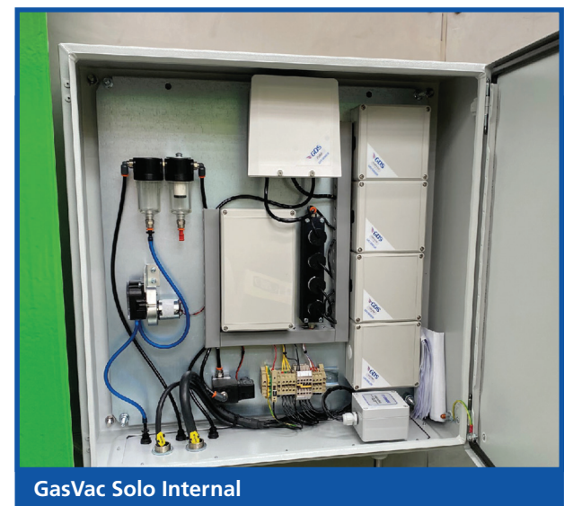
GasVac Solo Internal

Through our ongoing partnership, Gas Detection International will continue to provide service and maintenance support to the client, with GDS on hand to offer additional technical support as required. Both parties will continue to follow and support Advetec in their innovative journey in waste reduction and environmental impact.