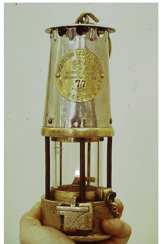
Figure 1: A modern flame safety lamp

Unfortunately, the firedamp control measures being applied in coal mines up to the early part of the 19th century were not always effective. For example, in 1812 a disastrous explosion occurred at Felling Colliery, Northumberland, killing 92 men and boys. In response, a local parson, the Reverend Hodgson,