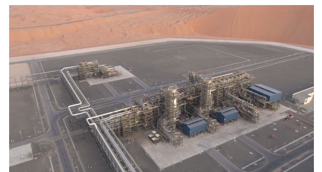
Daniel Sällstedt (Sky Eye Innovations): “Gas plants are usually very wide, but with our UAV solutions and FLIR cameras, you are able to scan these large areas very efficiently and also to provide a good overview.”

Author/Contact Details: Kristoff Maddelein FLIR Systems kristof.maddelein@flir.com