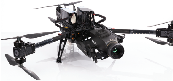
Daniel Sällstedt (Sky Eye Innovations): "We start by looking at a complete FLIR camera system and then build a UAV system around it."