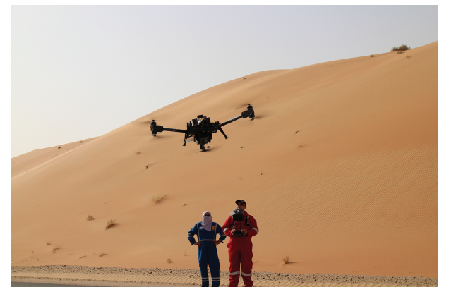
Daniel Sällstedt (Sky Eye Innovations): “We have made it possible for the operator to control the camera remotely from the ground with a joystick and operator screen.”

In spite of the many safety measures for the Al Hosn Shah Plant staff, the Western Area, marked as the red zone, still presents a significant health and safety risk for maintenance professionals and other operators.