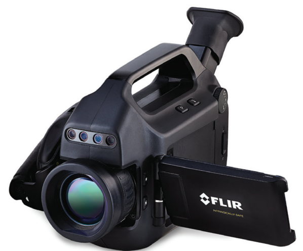
The FLIR GFx320 Intrinsically safe Optical Gas Imaging Camera

It takes only a few minutes to gather temperature set points on each tank. The rainbow palette in thermal images shows specific colors varying with temperature (see figure A & B). “High-contrast rainbow shows us the best temperature differences and our engineers like the range,” said Landon Hawkins, the engineer responsible for developing much of Noble Energy’s sand measurement method.