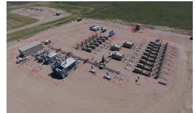
Separators at Noble Energy's Wells Ranch, Colorado site are located so close together that engineers need an intrinsically safe infrared camera to execute their sand measurement preventative maintenance program.