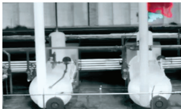
Alarming Leak (Area in Red)