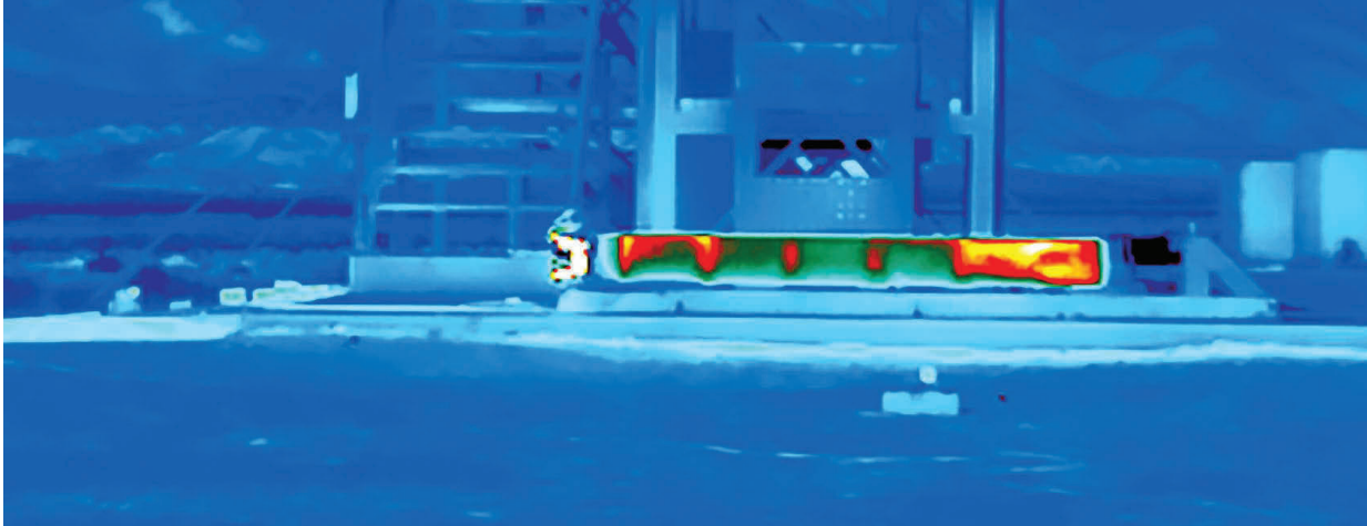
Figure 3. BATES Grains still evident after the rocket test.