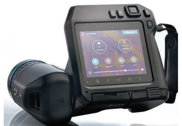
Figure 1. FLIR T540 Professional Thermal Camera

Following the rocket firing, Tewksbury continued to gather thermal data on the cooling rocket. "Well after the burn, a couple of