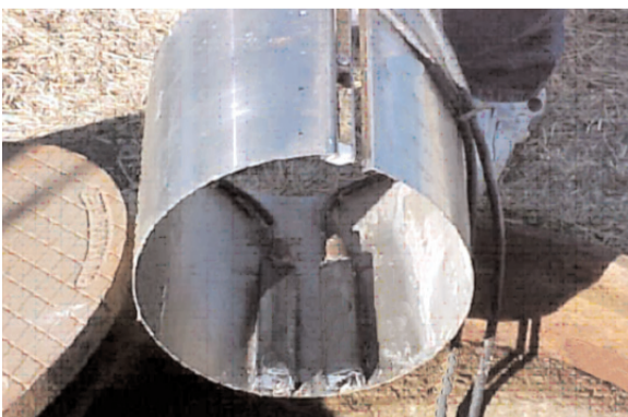
Figure 4. Dual area velocity sensors in mounting ring.

Setup and data management are handled with Isco's Flowlink software. Data may be exported into other software packages, or independent data may be imported into Flowlink software and manipulated along with the flow data. For flow meters deployed in sanitary sewers, the physical integrity of the casing, sensor, and cables is clearly an important consideration. This was tested under extreme conditions in the US during the September 2004 events of Hurricane Ivan (Figure 5). The rainfall and storm surge completely flooded sewers in Mobile, Alabama – including installed flow loggers – to depths of 15 feet or more. However, the 2150 flow meters continued to record accurate data.