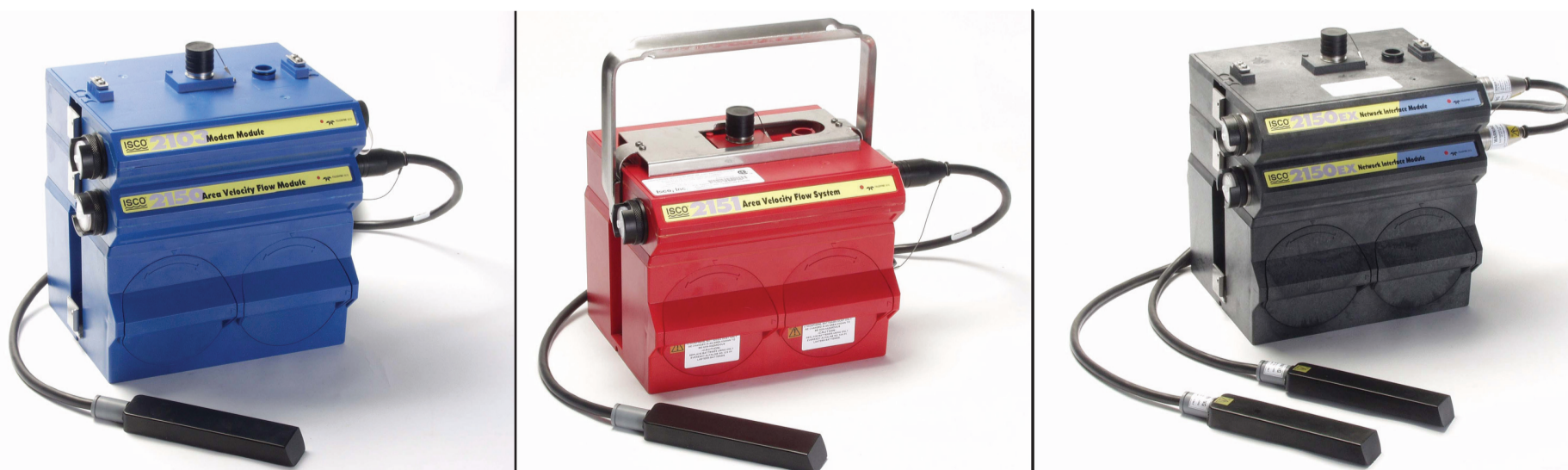
Figure 2. Modular, stackable design of the Isco 2100 Series allows compact configuration for redundant and multi-stream measurements. Left: the standard 2100 Series shown with Area Velocity and Modem Modules stacked on battery module. Centre: the 2151 models are rated for CSA Class 1 Div 1. Right: The 2150EX described in this article is approved under ATEX standard for Zone 0 locations.

Virtually all in-sewer locations in the UK are now categorised as Zone 1, based on the IEC and CEN-LEC standards. Table 1 shows the hazard and zone rating under both European and North American systems. Sewers fall into Class 1. Subdivision into "Zones" is based on the probability that a potentially explosive gas atmosphere may be present in a given location. Table 2 shows the difference between the zones: