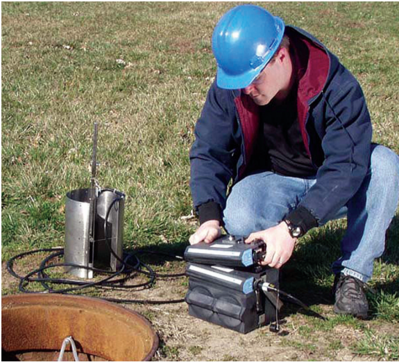
Figure 3. Quick, simple setup and deployment are popular features with field crews.