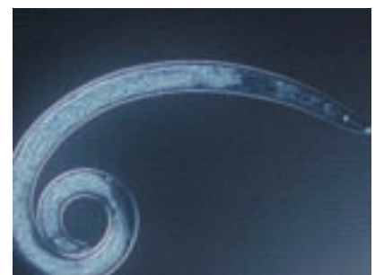
Figure 2: Plant parasitic nematode (200x magnification)

An exceptionally diverse group of very small worms which are ubiquitous in the environment (Figure 2). With the exception of plant parasitic nematodes, these soil dwellers predominantly help recycle nutrients by feeding on bacteria and fungi or even other nematodes. Hence, soil nematodes must be grouped depending on their feeding habits.