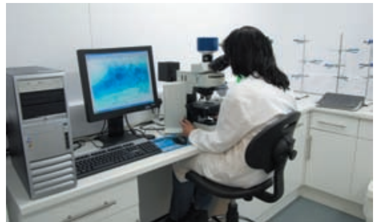
Figure 1: The Olympus BX51 microscope is used for differential interference contrast (DIC) and fluorescence microscopy at the Laverstoke Park Farm Soil Foodweb Laboratory

Micro-organisms perform a multitude of roles in the soil, including decomposing organic matter and in doing so releasing