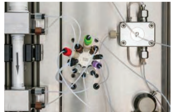
Figure 8 The low solvent consumption is supported by specially constructed, rotatable switching valves with dead space free passages.

The system could already impress with its performance at the interlaboratory testing (LVU) "Feed Fat 2013" of the European Reference Laboratory EURL in Freiburg. All analytical results came very close to the consensus values, which were determined by the EURL for LVU from data of all participating laboratories. "The future development of the DEXTech™ system will be aimed at a further reduction of the time needed for sample clean-up and thereby even more solvents will be saved," explains Bernsmann. "In addition, we would like to work on the reduction of materials whilst maintaining the same performance."