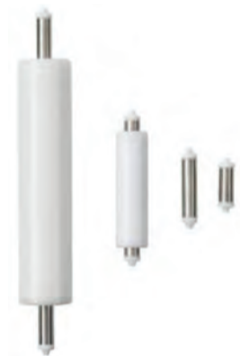
Figure 7 The conversion from a 4- into 3-column system is possible; dummy columns are included specifically for this purpose.