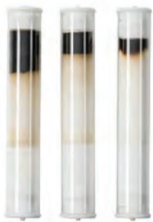
Figure 5 In the silica gel column, fats and other substances will be oxidised. Depending on the fat matrix, the DEXTech™ can process up to 5 g fat fully automatically. Since the column body is made from glass, the user can even optically control the processes. (From right to left: 1 g; 1.5 g; 3 g fat).

The device, which emerged from the collaboration, is characterised by a particularly simple mode of operation. Preparatory work includes only the connection of collection vessels to the output lines and clipping the ready-to-use columns into the holder – the other system's standard screw connections are omitted, the locking is done by the system itself. Also the placement under an extraction hood is not necessary owing to the closed system design. "Before the samples are processed, the fat is extracted first. There are different ways to do this, e.g. by a Soxhlet-Extraction", says Bernsmann. "Here fore, the fat together with the internal standards is dissolved in 5 mL hexane and 2 mL toluene and under rinsing with hexane, the solution is quantitatively transferred into the sample loop. "Injection into the sample loop is the only manual step of the entire preparation process, everything else runs fully automatic after you start the device.