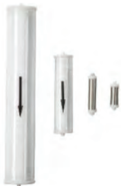
Figure 4 The DEXTech™ system consists of, (from left to right) a silica gel column impregnated with sulphuric acid, a Florisil column, and two carbon columns of different activity.