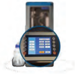
Figure 6 Owing to the pre-set standard method, method development is not necessary. However, the system allows to adapt individual processing steps or to program a completely new method via touch screen permitting a very flexible use of the system.

This universal method is suitable for food and feed samples as well as for environmental samples and enables any matrix to be processed. The method is pre-set in DEXTech™ and therefore can be easily applied to all. "Method development is no longer necessary. However, the system allows to adapt individual processing steps or to program a new method via touch screen, such that the device can be used very flexibly," says Bernsmann. A conversion from a 4- into a 3-column system is possible; dummy columns are included specifically for this purpose.