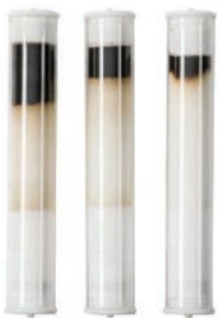
Figure 5 In the silica gel column, fats and other substances will be oxidised. Depending on the fat matrix, the DEXTech™ can process up to 5 g fat fully automatically. Since the column body is made from glass, the user can even optically control the processes. (From right to left: 1 g; 1.5 g; 3 g fat).

The device, which emerged from the collaboration, is characterised by a particularly simple mode of operation. Preparatory work includes only the connection of collection vessels to the output lines and clipping the ready-to-use columns into the holder – the other system's standard screw connections are omitted, the locking is done by the system itself. Also the placement under an extraction hood is not necessary owing to the closed system design. "Before the samples are processed, the fat is extracted first. There are different ways to do this, e.g. by a Soxhlet-Extraction", says Bernsmann. "Here fore, the fat together with the internal standards is dissolved in 5 mL hexane and 2 mL toluene and under rinsing with hexane, the solution is quantitatively transferred into the sample loop. "Injection into the sample loop is the only manual step of the entire preparation process, everything else runs fully automatic after you start the device.