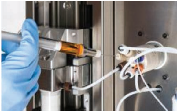
Figure 3 Injection into the sample loop is the only manual step of the entire preparation process, everything else runs fully automatically after you start the device.