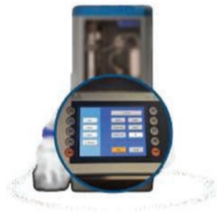
Figure 6 Owing to the pre-set standard method, method development is not necessary. However, the system allows to adapt individual processing steps or to program a completely new method via touch screen permitting a very flexible use of the system.

This universal method is suitable for food and feed samples as well as for environmental samples and enables any matrix to be processed. The method is pre-set in DEXTech™ and therefore can be easily applied to all. "Method development is no longer necessary. However, the system allows to adapt individual processing steps or to program a new method via touch screen, such that the device can be used very flexibly," says Bernsmann. A conversion from a 4- into a 3-column system is possible; dummy columns are included specifically for this purpose.