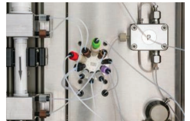
Figure 8 The low solvent consumption is supported by specially constructed, rotatable switching valves with dead space free passages.

The system could already impress with its performance at the interlaboratory testing (LVU) "Feed Fat 2013" of the European Reference Laboratory EURL in Freiburg. All analytical results came very close to the consensus values, which were determined by the EURL for LVU from data of all participating laboratories. "The future development of the DEXTech™ system will be aimed at a further reduction of the time needed for sample clean-up and thereby even more solvents will be saved," explains Bernsmann. "In addition, we would like to work on the reduction of materials whilst maintaining the same performance."