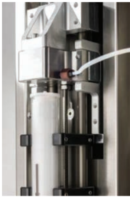
Figure 2 The device, which emerged from the collaboration, is characterised by a particularly simple mode of operation. Preparatory work includes only the connection of collection vessels to the output lines and clipping the ready-to-use columns into the holder – the other system's standard screw connections are omitted, the locking is done by the system.