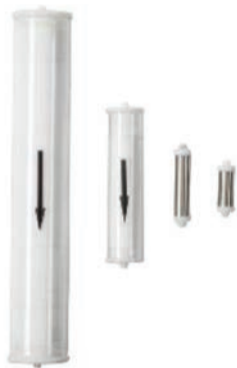
Figure 4 The DEXTech™ system consists of, (from left to right) a silica gel column impregnated with sulphuric acid, a Florisil column, and two carbon columns of different activity.