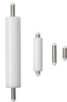
Figure 7 The conversion from a 4- into 3-column system is possible; dummy columns are included specifically for this purpose.