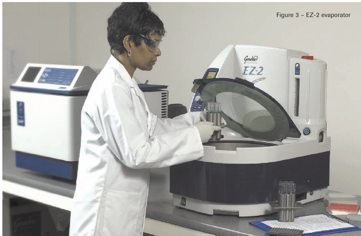
Figure 3 – EZ-2 evaporator

Chromatography is carried out on either GC-MS or on LC-UV-MS, with GC-MS used for the detection of PCBs and predominantly HPLC for PAHs. Heavy metals are determined in the traditional way using graphite-furnace atomic absorption or more recently, inductively coupled plasma emission spectroscopy.