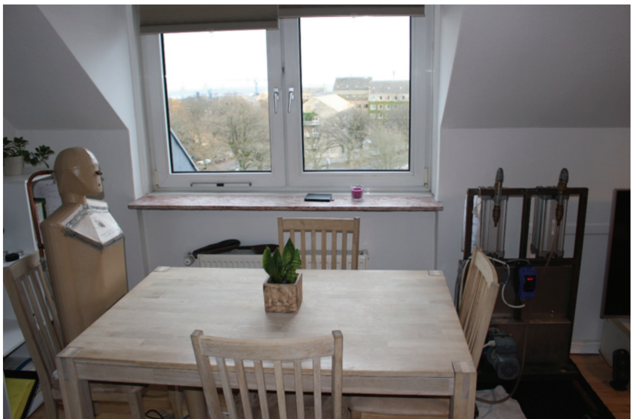
Figure 1: Breathing Thermal Manikin in sitting position during the sampling (left) and its artificial lungs system (right)

Understandably, there are growing concerns over the potential health risks associated with MP ingestion and inhalation. These concerns are warranted as the presence of MP-associated micropollutants could pose adverse health implications, for example, airborne MPs are suspected of acting as vectors