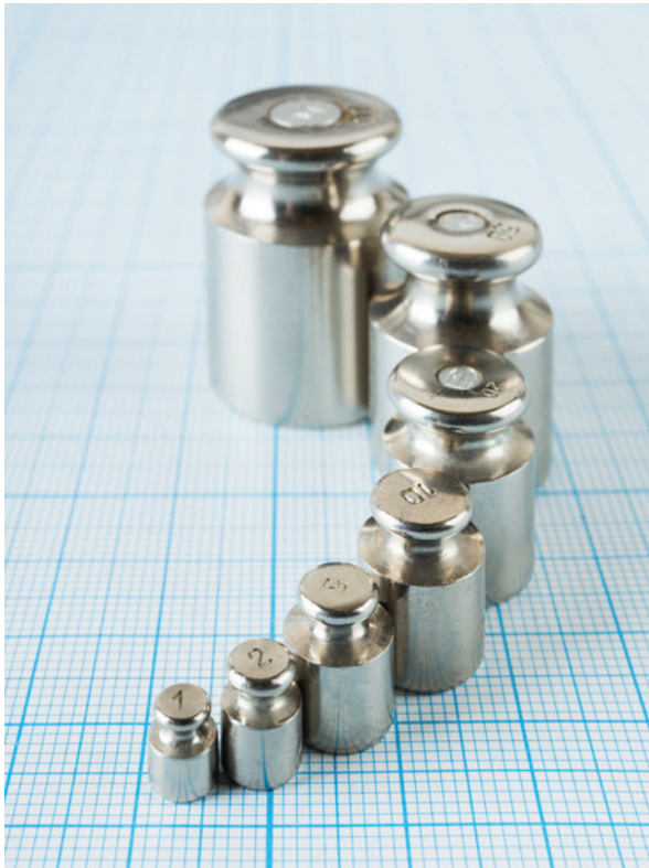
Kilogram and other masses