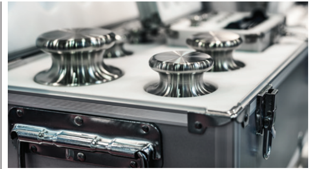
Kilogram and other standard masses