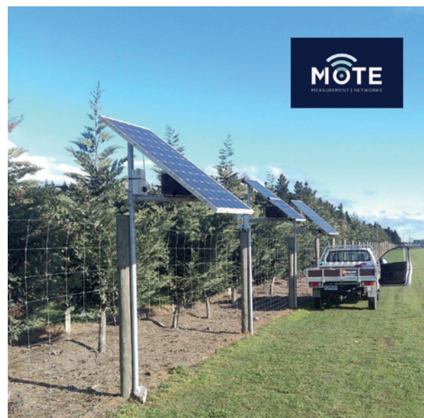
Mote Roadside Air Quality Monitoring array to measure RCS and PM10

In effect, the analytical instrument is reliant on the accuracy of the calibration gas mixture. But how can we be sure that the calibration gas mixture itself is accurate? This chain of dominoes is the essence of traceable measurement and, for the measurement of chemical concentration, the roots end up at the international prototype kilogram (IPK) mass stored at the International Bureau of Weights and Measures (BIPM) in Saint-Cloud, France.