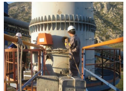
Monitoring Certification Scheme (MCERTS) to improve the quality of monitoring data. MCERTS delivers:

To this end, the Agency has established its