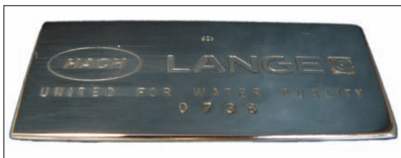
10,000 COD cuvettes are used to create one silver bar

On arrival at the Environment Centre, the reagents are weighed and sorted. Packaging is either recycled or reused and the remainder is sorted into four main waste groups: cyanide-containing reagents; acid-containing reagents; mercurial reagents and AOX-containing reagents.