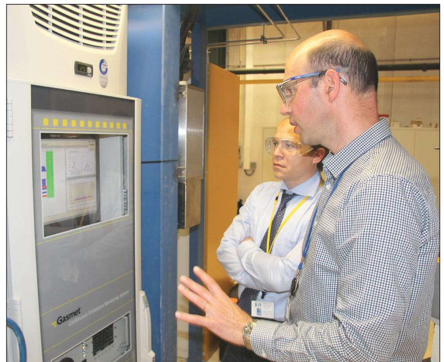
A fixed FTIR analyser provides near real-time monitoring of flue gas treatment efficiency

Using Calcmet™ software users of Gaset analysers are able to analyse sample spectra, producing almost real-time data for pre-selected compounds. However, the retention