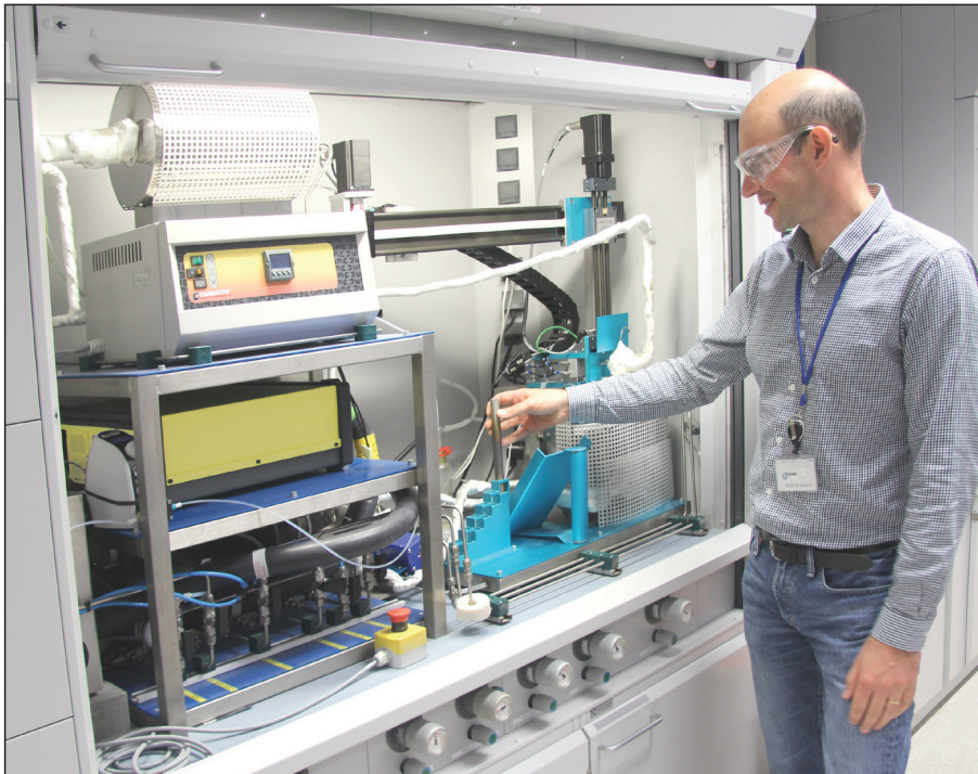
FTIR gas analysis and test automation have increased throughput tenfold.

separate bench for HCl, which further extended the time taken for the tests and introduced a higher possibility of experimental error. A key advantage of FTIR is that it measures both SO 2 and HCl, and does so without removing water from the sample."