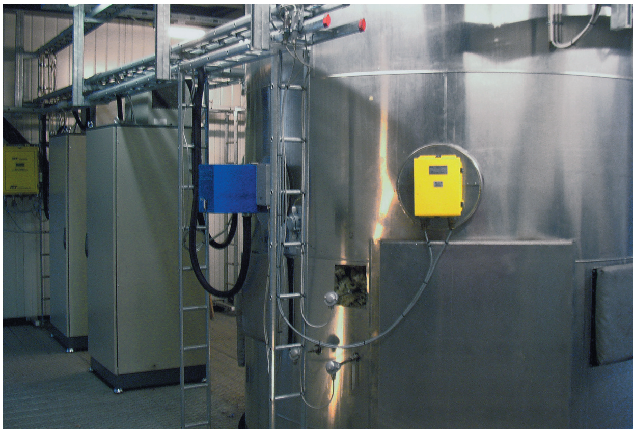
Figure 3: Installed MT91 Flow Meter

downstream from the meter installation, seasonal weather variability and production changes in plant throughput.