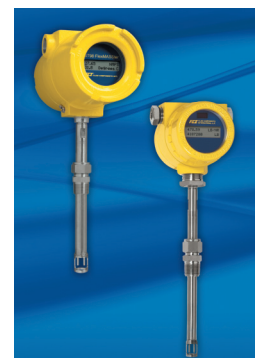
Figure 2: ST51 and ST98 Flow Meter

The accuracy and repeatability of many flow meter technologies also varies depending on line sizes, the equipment upstream and