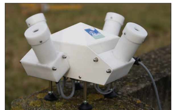
Fig 2: CIR-4V

For domestic use, it is recommended to verify the PV conversion efficiency by monitoring the global radiation by use of a total pyranometer. For industrial uses, the monitoring of cloud cover allows one to efficiently manage the difference sources of green energy.