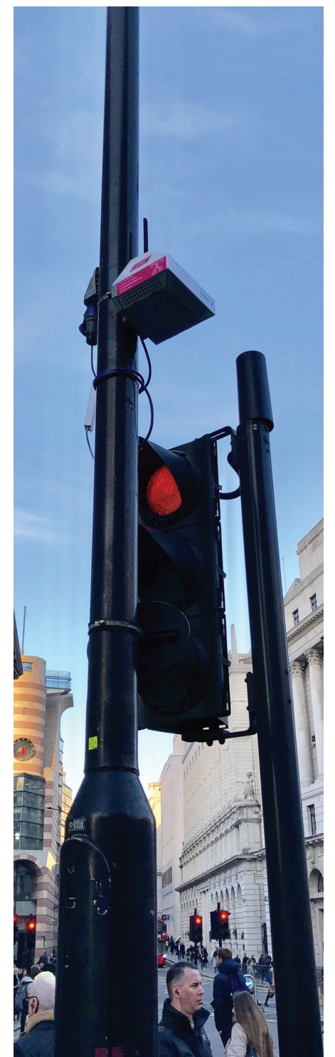
110 AQMesh pods deliver hyperlocal data to the Breathe London website

In addition, networks benefit from improved operational reliability because one monitor showing unusual readings might indicate a problem with that monitor, whereas a group of monitors all showing unusual readings is more