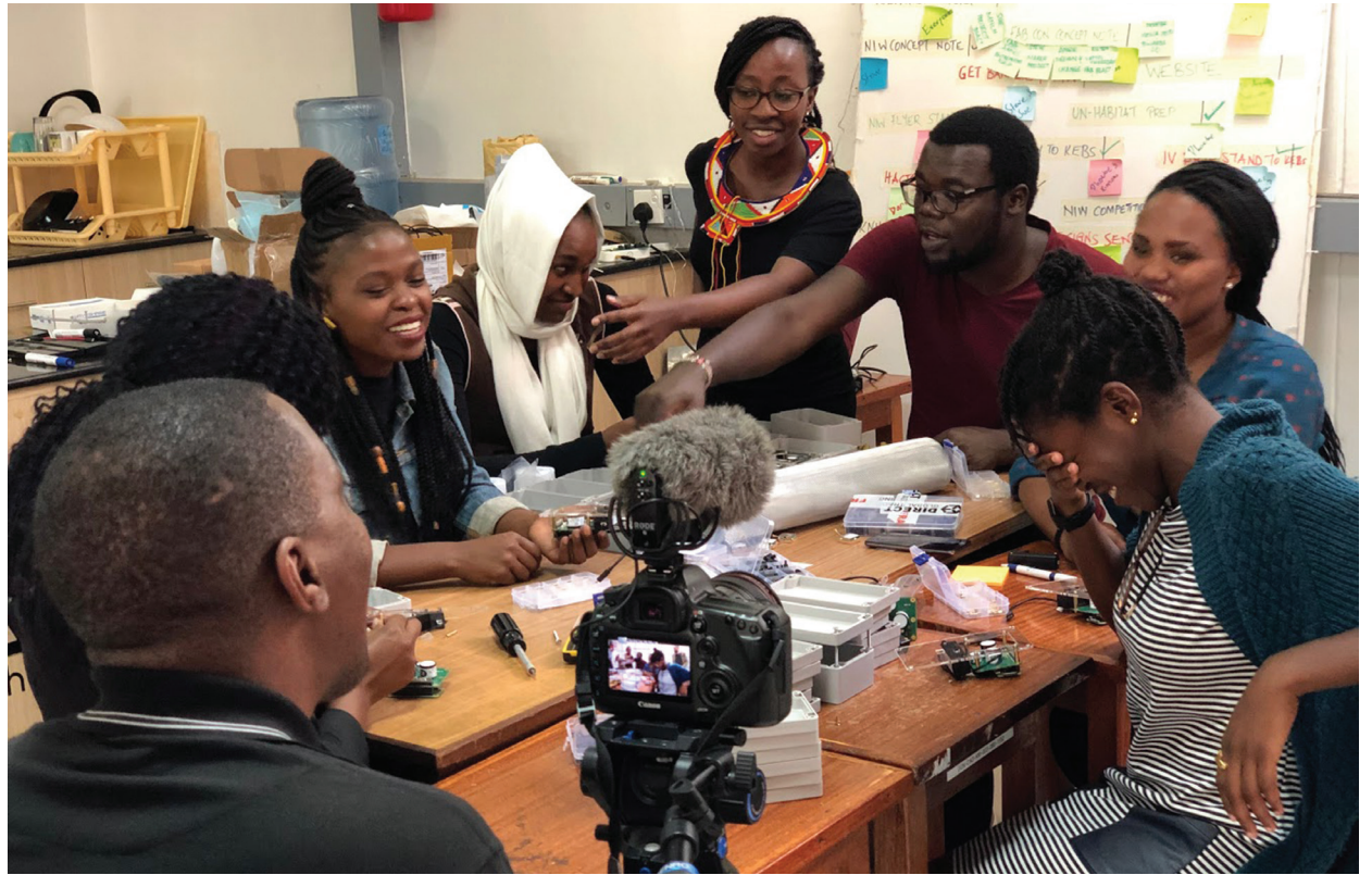
Training was provided at maker spaces in Nairobi

These projects do not require the accuracy of industrial grade low cost air quality networks, which is important because now these low cost sensors can be used in lower cost housings that require little maintenance and validation, which reduces the initial network cost and effectively eliminates maintenance costs. These citizen science air quality units are effective at identifying pollution hot-spots and help citizens to better understand the local issues