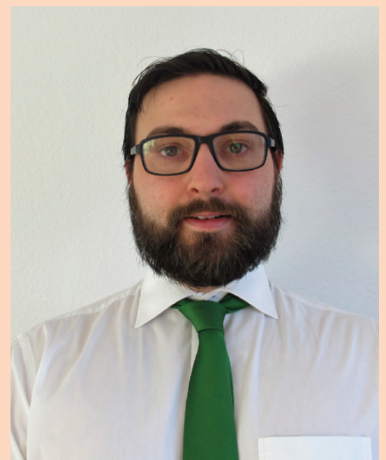
Author: Tobias Henrich

AGT-PSG is one of the leading manufacturers with more than 2500 different tube bundles and analysis lines. As the only supplier on the market, the medium-sized company produces gas sampling probes, heated sample lines, sample gas coolers and complete sample gas conditionings. This ensures sampling, transport and preparation of measuring gases from a single source - all according to the company's vision: Perfect Sample Gas.